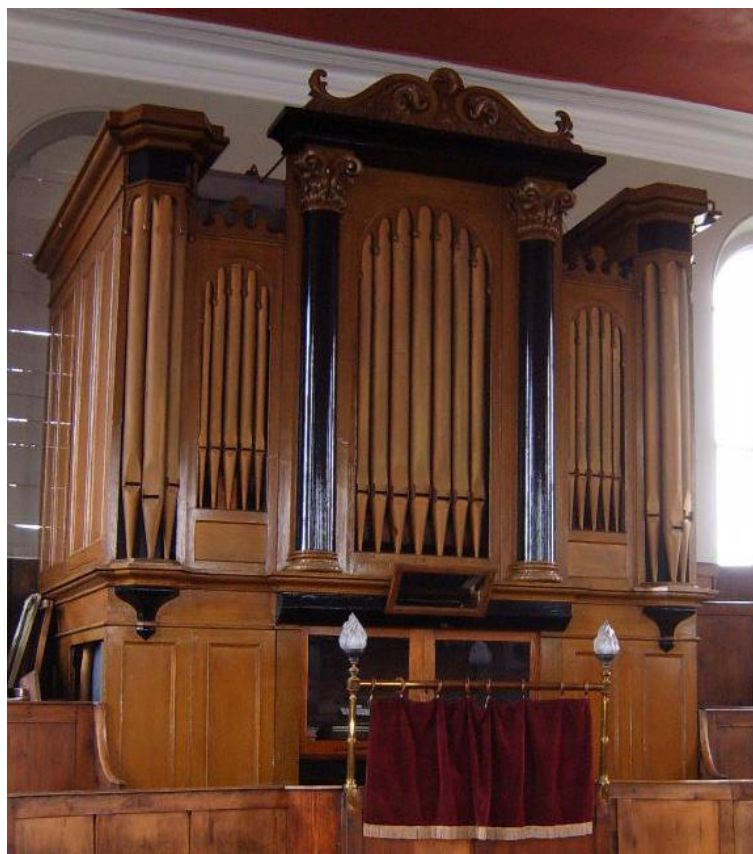
Figure 6: Casing detail