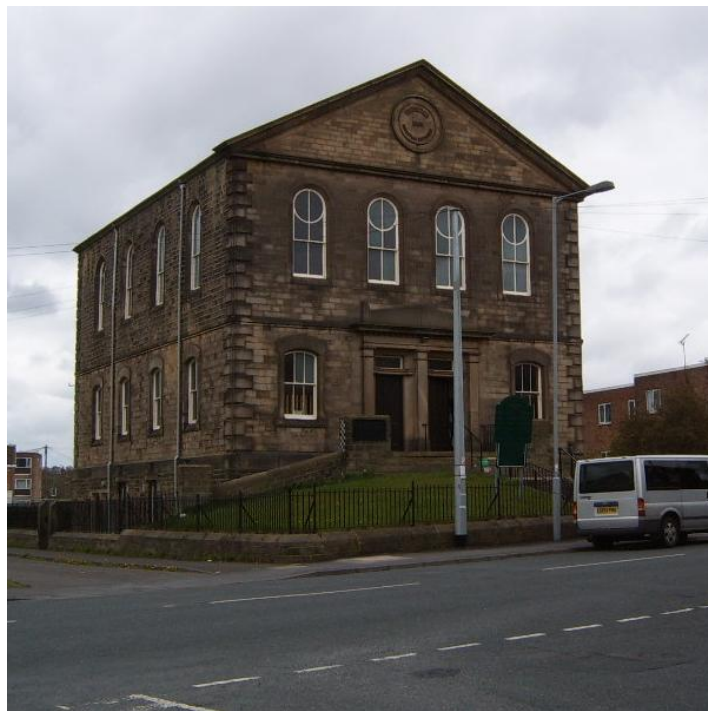
Figure 4: Bingley Independent Methodist Church, built in 1868

It appears that this was the “Ebenezer Brethren” building, built in 1868, and now the home of the Bingley Independent Methodist Church.