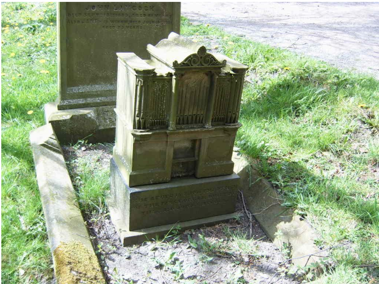
Figure 1: The Kildwick “organ grave”