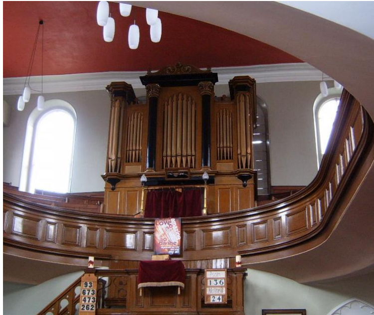
Figure 5: Laycock's first major organ in the gallery of Bingley Independent Methodist Church